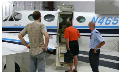
... fortunately, he did not find any!