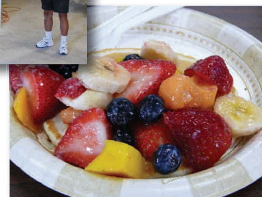
Betty's mouth watering 4-berry fruit salad went very well with the pancakes - YUMMY!!

The Chapter 99 members and guests enjoyed a delicious breakfast of pancakes, pastry and mixed fruit. These Saturday morning sessions are a great social event where along with enjoying the food, those present can exchange ideas, ask questions, swap stories, get to know each other or just have a good time, for example play: