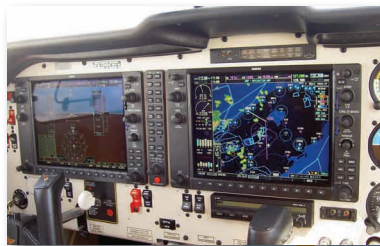
G1000 in the Mooney