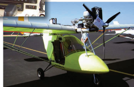
Flightstar IISL 2

Flightstar IISL 2 place Light Sport, less than 200 hrs., Rotax 582, liquid cooled, electric start, radio & BRS chute. A great fun flyer. $15,995.00 Call 772-567-2506 or e-mail ketner@bellsouth.net