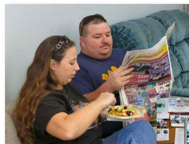
Parents enjoying breakfast and the paper while they wait