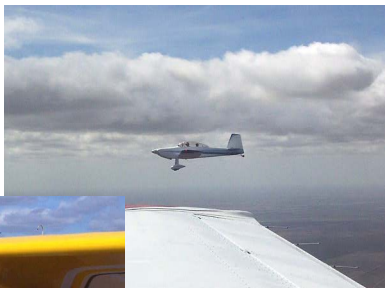
Bill Zorc's RV off the wingtip of Gerd's Mooney