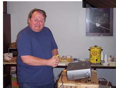
Cliff powered by the projector or vice versa?