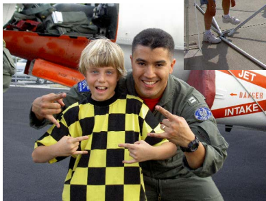
Ready for Saturday!

For the second year in a row, the event was plagued by bad weather. The day started out windy and rainy with the field IFR for hours. Over half of the aircraft expected just couldn't make it. There were no airplane or helicopter rides. Display aircraft including all the light sports except one were absent. The modelers tried, but were forced to leave due to the high winds.